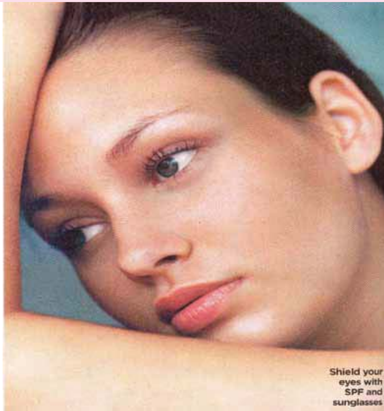
Shield your eyes with SPF and sunglasses