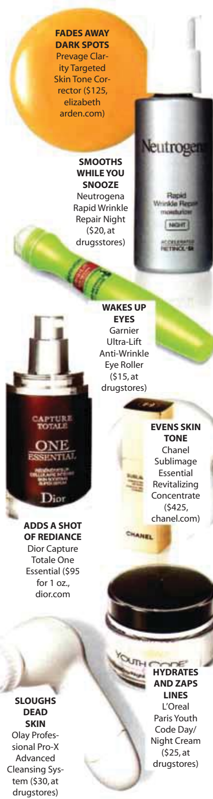
FADES AWAY DARK SPOTS Prevege Clarity Targeted Skin Tone Corrector ($125, elizabetharden.com)

Seven secret weapons of younger-looking skin. So nice to know!